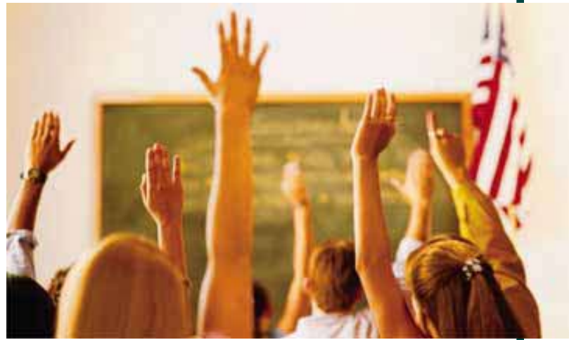
Green Kids inspires young people to change their behaviour, which will reduce their carbon emissions.

Green Kids is an independent, charitable (registered-charity), environmental theatre group that is reliant on independent funding. We are counting on organizations like you to recognize the vital importance of educating children about environmental issues, and the value in training the adults of tomorrow to be environmentally minded when making their choices. Your sponsorship has never been more vital. At the moment, many schools don't have money in their budgets to pay for our performances. That's why it is imperative that we find funding; so that we can continue to tour and bring the environmental facts to school aged children and their communities. We continue to expand our programming to the betterment of our society, but we are completely dependant on funders in order to do so.