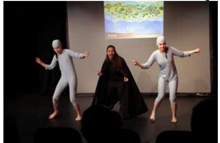
Actors perform in Ebb & Flo.

Green Kids Incorporated (Green Kids) is a non-profit, live-theatre group, and the only charity in Canada dedicated solely to environmental education for young people through performance. Green Kids was established in 1991 to address the need for entertaining, educational programming for school aged children about the importance of environmental stewardship. Geared towards inspiring a new generation of environmentally conscious adults, the first Green Kids tour was only one week long and reached 2,000 children. In the last 19 years Green Kids has grown in vision and scope and has entertained over 1 million students, their educators, and local communities in over 1,000 schools. Additionally, we have been nominated three times for the Sustainable Development Award of Excellence. We are now planning our 2011 season, and we are aiming to produce an interactive two-month, live theatre tour, that spans five provinces and reaches more than 100,000 children (budget dependant). Dedicated to spreading positive, pro-active environmental message to Canadian children, Green Kids will present a short play with educational content using humour, talent and a passion for the environment.