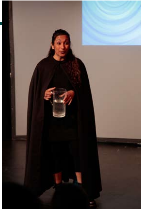
Proteus holds a pitcher of water.