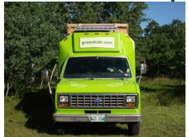
Our Bio-bus is both functional and educational.