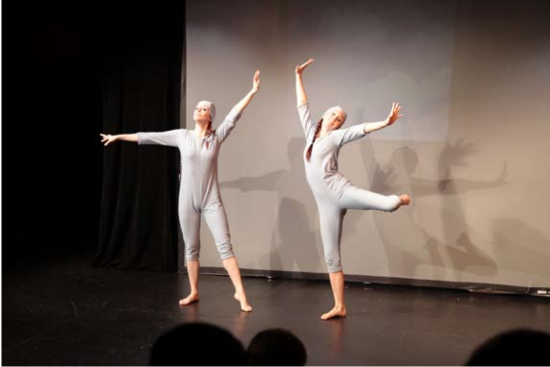
Ebb and Flo cast perform at a school.