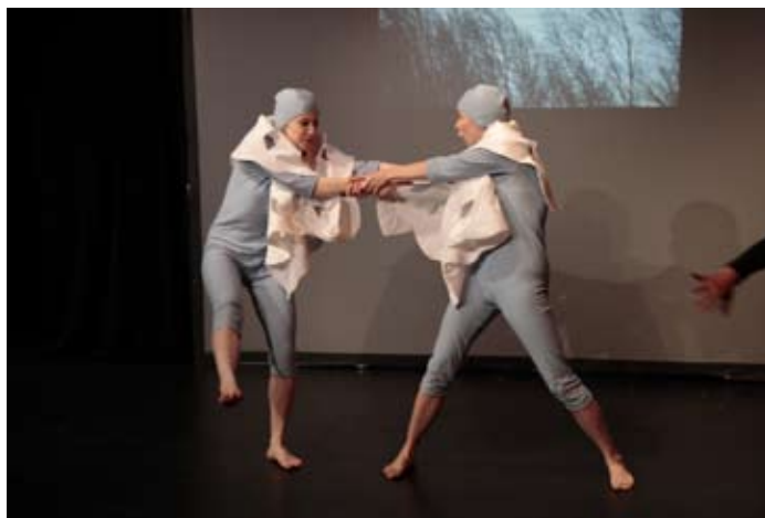
Ebb and Flo get caught up in a storm.