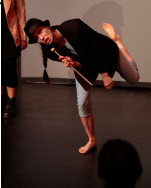
A business man makes his pitch.